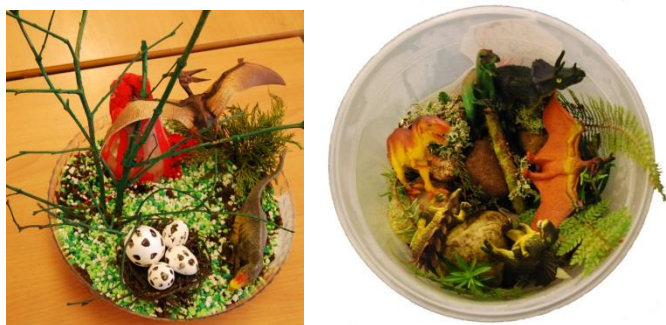
The children made fantastic dinosaur models at home.

Our EYU pupils have started with a topic on dinosaurs and spent this week following dinosaur footprints and searching for eggs!