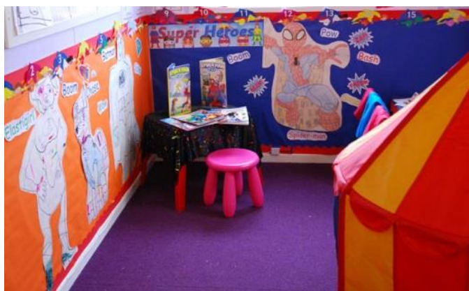
Nursery has created a superheroes role play area.

Welcome back to term 4, hopefully Spring is on the way! There are lots of exciting topics going on in school this term. We kick-started the term with our aspirations day based on this term's value 'Heroes'. Children are being encouraged to think of their heroes in and out of school and what makes them a hero. Maybe you can talk about this more at home?