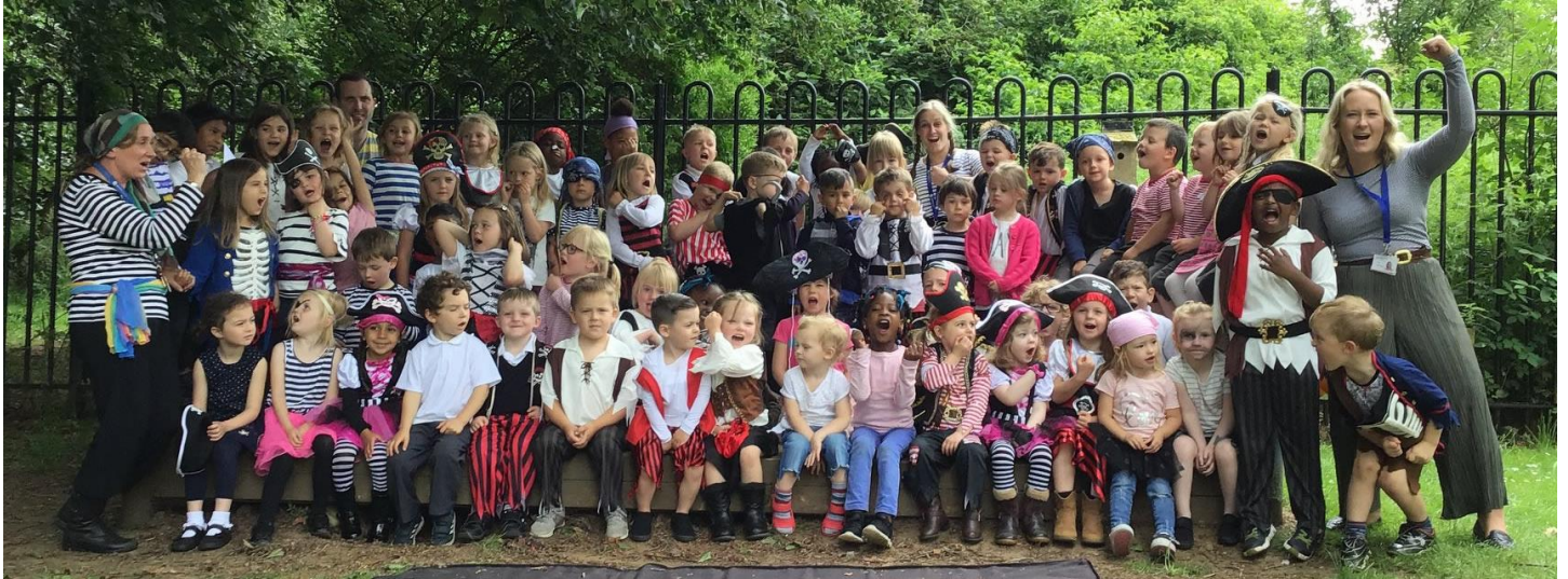
Early Years children and staff enjoying Pirate Day