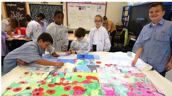
Owls class hard at work creating Pointillism poppies.

There are some lovely class displays along the main corridor of work the children have produced for their Remembrance Day Poppy projects.